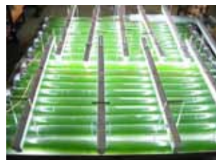
Growth of Microalgae in 170L PBR, indoor condition