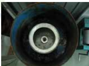
Centrifuge to get biomass