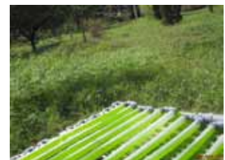
Growth of Microalgae in 170L PBR, outdoor condition