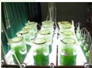
Growth of Microalgae in 500mL bottle