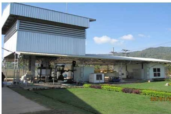
Biomass gasification plants

This project is innovative as it incorporates the development of business models of biomass power generation using gasification technology with the consideration of raw material management, production management, marketing plan, community engagement and environmental management. A business plan manual will be developed and can be used for all other areas not covered by this project. Policy makers on renewable energy can use this project as a guideline.