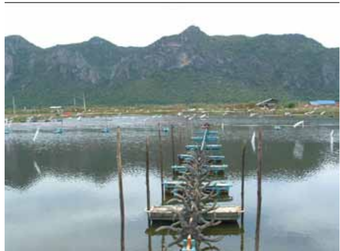
Shrimp Farm in Thailand